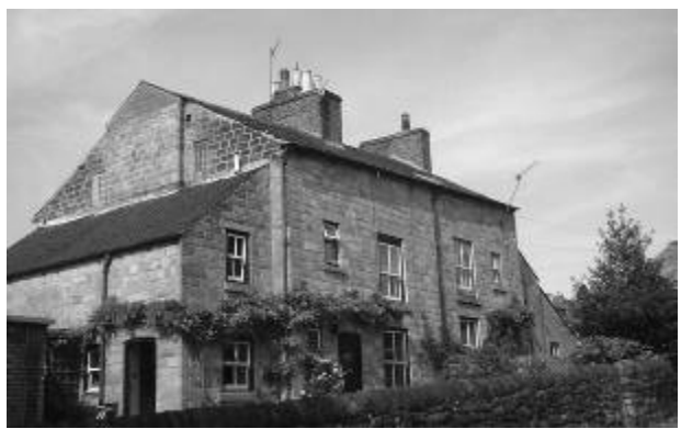
A "cluster" of four back-to-backs (Bakewell & Partners)

These houses are all are well lived in and loved, but Milford is becoming a dormitory – it has lost its last useful shop. However, the space on the valley floor has been targeted by developers. One development has already gone ahead, of terraced housing with frankly odd details – such as half pediments atop bays – and very little reference to the wonderful sense of place. Another is proposed – for five storeys in the place of the old mill. Residents are up in arms and rightly so – the development will radically change the appearance of the village while giving it not one new facility.