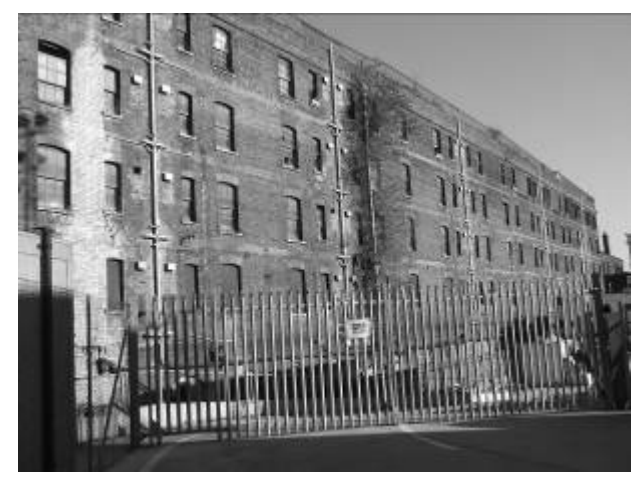
The Culross building 1891-2, facing the bulldozer

These two tenement buildings, which sit in the Kings Cross Railwaylands conservation area, and one of which is listed (Stanley) are in the way of Argent St George's massive scheme for the railwaylands – the area between Kings Cross and St Pancras stations. Stanley North is in the way of a proposed road and Culross is in the way of a "desire line", a pedestrian (and possibly later on tram) route. Neither of these is necessary – the road can be routed around the building and the "desire line" could be routed through Culross – a long thin building – to create a real sense of drama.