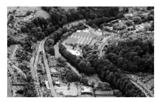
Milford with terraces following the contours discernable (above), and from the other side of the valley (below)

Your Secretary was invited to give a talk to the Belper Civic forum a little earlier in the year and took the opportunity to have a look at the issues affecting the historic centre of Belper and the neighbouring village of Milford – which are very different in character and in the nature of the problems they face. Both owe their prosperity to the fast flowing River Derwent which provided the power for their mills, but whereas Belper developed into a sizable town, Milford remained essentially a village.