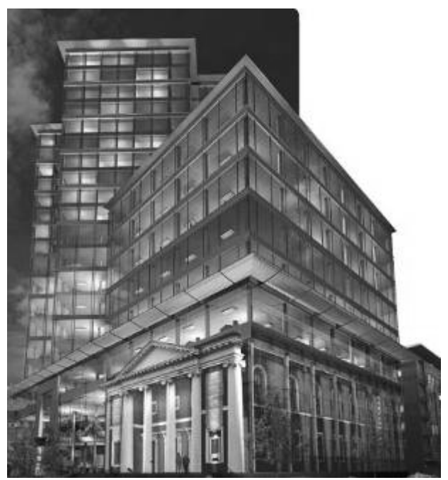
Glaze Be! May Street Church proposals by Barnabus Ventures

Such is the desperation of some to make money from development that they will go to the most extraordinary lengths to create development sites. The proposals for the 1829 handsome Greek Revival May Street Presbyterian Church in Belfast are a case in point and would normally be filed under "b" for barking mad. It would appear that the church was proposing to sell its air rights to a developer, which proposed building over and around the church, in effect sticking a tall office block atop an important listed building. The proposals have been fought off: Belfast isn't exactly desperately short of development space.