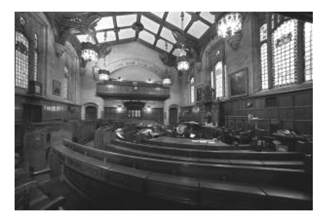
Condemned? The interior of court 3 at Middlesex Guildhall

In the meantime SAVE and the Friends of Middlesex Guildhall held, at very short notice, an evening at the Guildhall for members of the judiciary and conservation professionals and other interested individuals. The turnout was excellent, and the issues were debated in Court three, with the DCA's architects giving their reasoning. The debate proved that the existing layout works tremendously well.