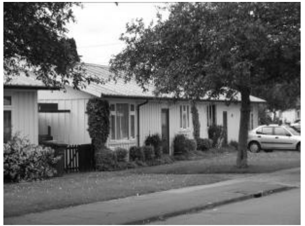
Wide verges, generous accommodation, rare buildings.

the rest are rented, with the average tenancy being around 27 years. This is a settled community.