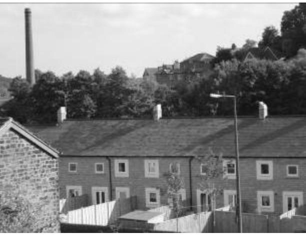
New build in Milford – nearly but not quite right for the place

Milford has lost its mill while Belper retains the majority of its main mill complex, yet both retain much of their mill housing, in a remarkable variety of forms – in Belper there are beautiful stone terraces and rare semi-detatched back-to- backs. The geography is not as extreme as Milford, which clings to the steep-sided valley, forming a natural amphitheatre much like Bradford on Avon, only more, intimate, and with an empty space on the valley floor where the mill once stood. This dictates the form of the housing, which follows the contours, with back-to-backs taking advantage of this – on the upside of the hill two houses on two storeys backing on to three houses on three storeys on the downside of the hill.